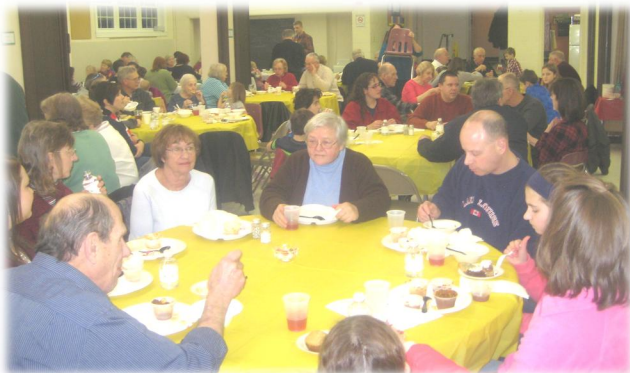
Everyone enjoyed having time ... to just talk!!