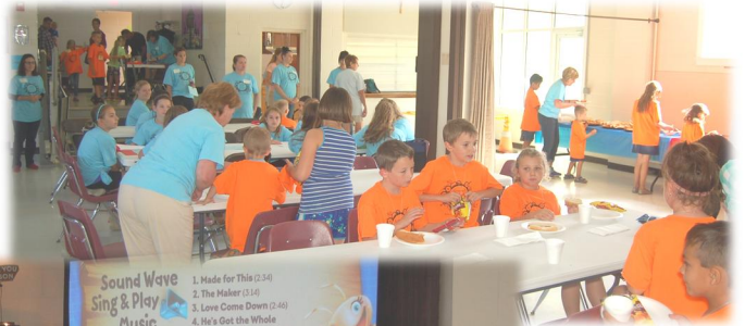
Sharing a meal helped friendships to grow!!