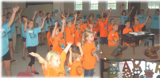
Lively music and hand motions energized the group!!