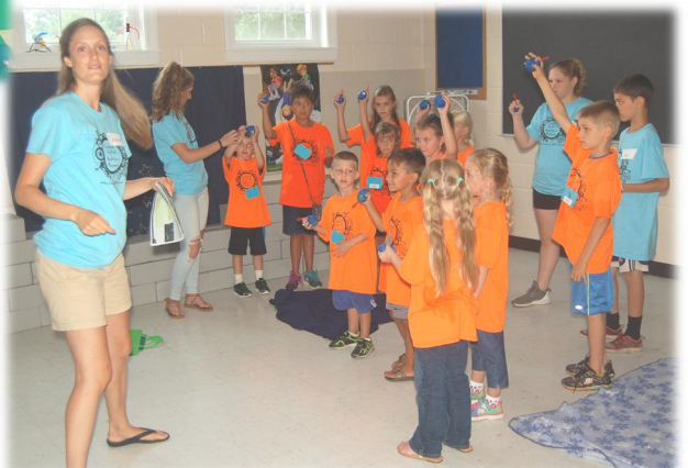
Bible stories "came to life" through word and actions!!