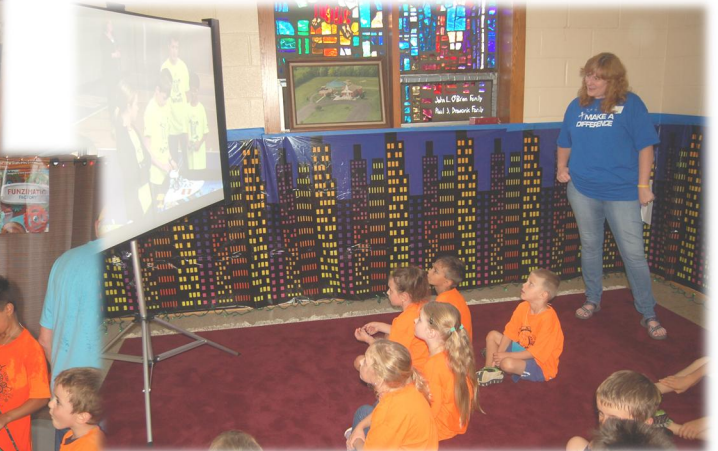
Short video clips reinforced daily themes and engaged the interests of the children.