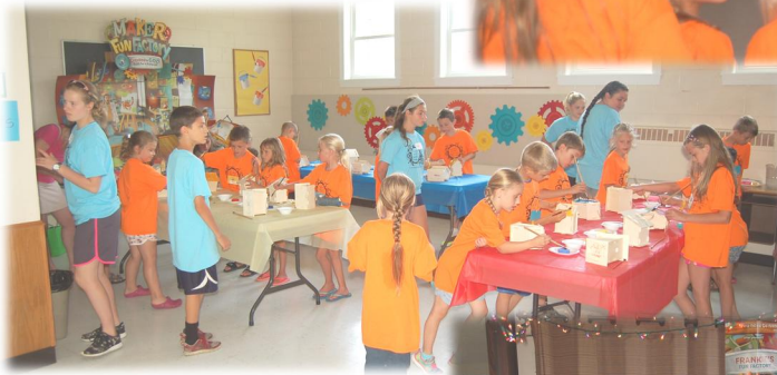
Participants created beautiful birdhouses to care for God's creatures!!